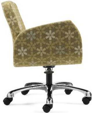
2811-8 Medium Back Swivel - Side view